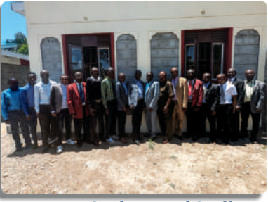
Kenya Students and Staff

We are also trying to construct one more small building on our school property in Kenya for an office and guesthouse. If there is anyone who can offer their support, we would be extremely grateful. We need