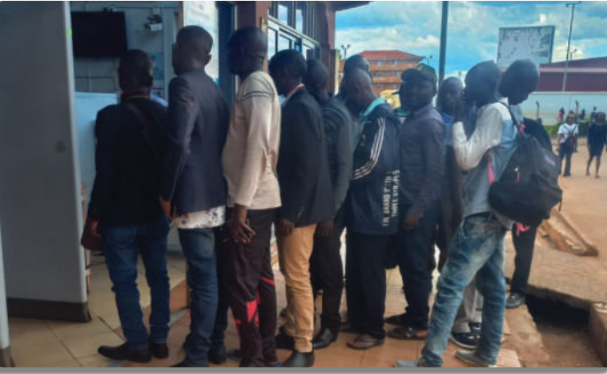
Students at Baggage Check

Zambia. Our plan is for their classes to begin in Livingstone on April 15<sup>th</sup>, and they will graduate at the end of September. Please keep them in your prayers as they journey and continue their schooling in Livingstone.