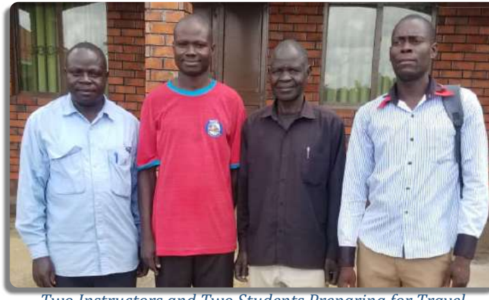
Two Instructors and Two Students Preparing for Travel

A big thanks to all who have supported the Uganda work over the years. The East African School of Biblical studies has been a beacon of light in Uganda since 2003, and so much good work has come from our labors done there. It is only through our joint efforts that we are able to do such great things for the Lord in Uganda, and we will continue to do our best to see that the faithful of Uganda are trained and have an opportunity to receive proper schooling.