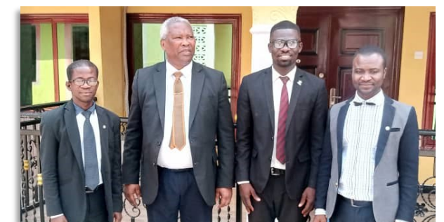
Faculty in Front of the School