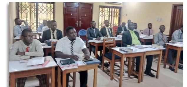
Students in Class