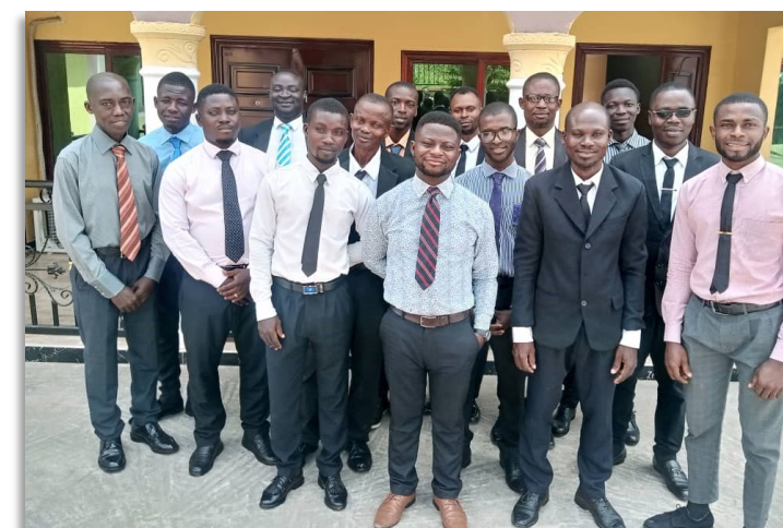
Students of the School

Here are some pictures of the new class from the first day of school: