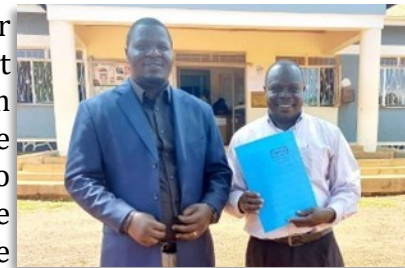
Acquiring Registration Documents

Let me thank you all for your love and support of the good work in Uganda. Together we are doing a lot to spread the truth of the gospel of Christ to the lost of East Africa. We love and appreciate you all!