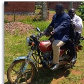
Traveling by Motorcycle