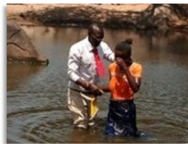
A Baptism in Zambia