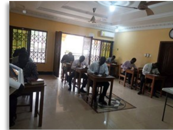
Students in Class

September has been another blessed month in Ghana. Classes have now begun for the final quarter of studies, and graduation draws nearer and nearer. It is always amazing to me how quickly time flies by with every class. Before you know it November 12 th will be here, and another nine men will have graduated from the Missouri Institute of Biblical Studies Ghana.