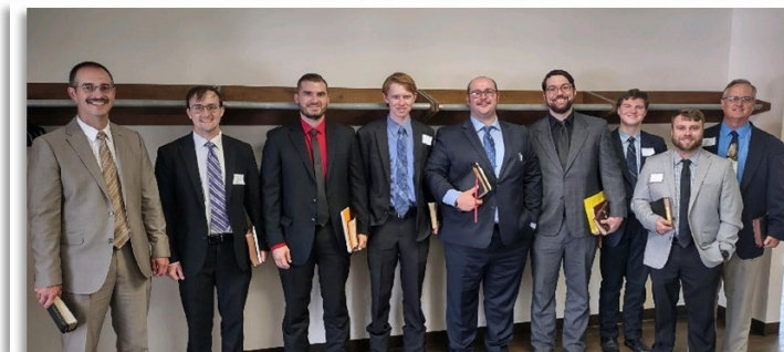
Students and Staff at 39th Street Lectureship

As our custom has been for some time, we take our students each year to a day of the lectureship at the 39 th Street Church of Christ in Independence, Missouri. This allows them to hear many different preachers proclaim the Word of God. This is good not only for their continued growth in God's Word but also for them to hear many different styles of preaching. It is always a good day of fellowship with brethren and feasting on God's Word. We are thankful that God's Word is always a lamp to our feet during our daily service to Him (Psa. 119:105).