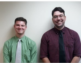
Second Year Students