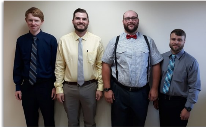
First Year Students

School is back in session! We had orientation on August 2 nd and began classes the following day.