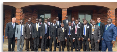
2020 Graduating Class and Instructors

Also, in our visit we participated in the Graduation Ceremony of the 2020 class. Because our inability to visit for two years, this class finished their studies last year. Over 60 attended the Ceremony as