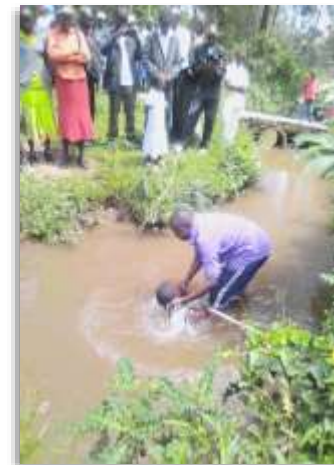
Graduate baptizing new convert for a new congregation

Because of the uncertain circumstances, our supporters are in agreement that we will only open in February of next year when we are sure we will be free to operate and our Kenyan students will be able to enter the country without restrictions. As the present class had just started its second year of training this year before being closed in March, we will restart the students in their second year and they will graduate at the end of 2021.