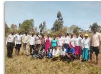
Sixteen baptized into Christ

The work in Uganda continues but the school is still shut down because of the Covid Pandemic. The Presidential Election takes place in January of next year and this causes additional problems in the opening of schools in Zambia. With the Covid pandemic going on no political rallies can take place. Consequently, the entire country will probably be shut down until the elections are over. We do think that we will be able to open early next year and hopefully in February. In the meantime, evangelism is still taking place under the watchful eyes of the authorities to make sure that the restrictions placed on the people by the government are obeyed. We ask for you continued prayers for the ongoing work in Uganda.