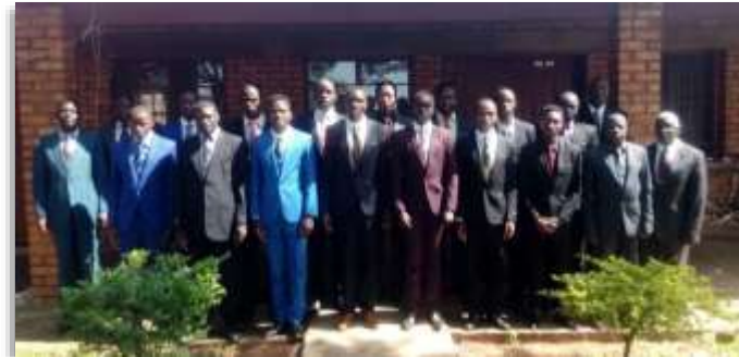
Zambia School of Biblical Studies graduating class of 2020

Pictured above is the 15th graduating class of the Zambia School of Biblical Studies. This class finished their two year training program on the 20th of November. Because of our inability to go to the Graduation Ceremony, the class requested that a formal graduation ceremony be held in 2021. They have all made sacrifices in coming to the school and this is very important to them so we will honor their request. Sometime next year, possibly in July, 16 men will have their graduation to honor their labors.